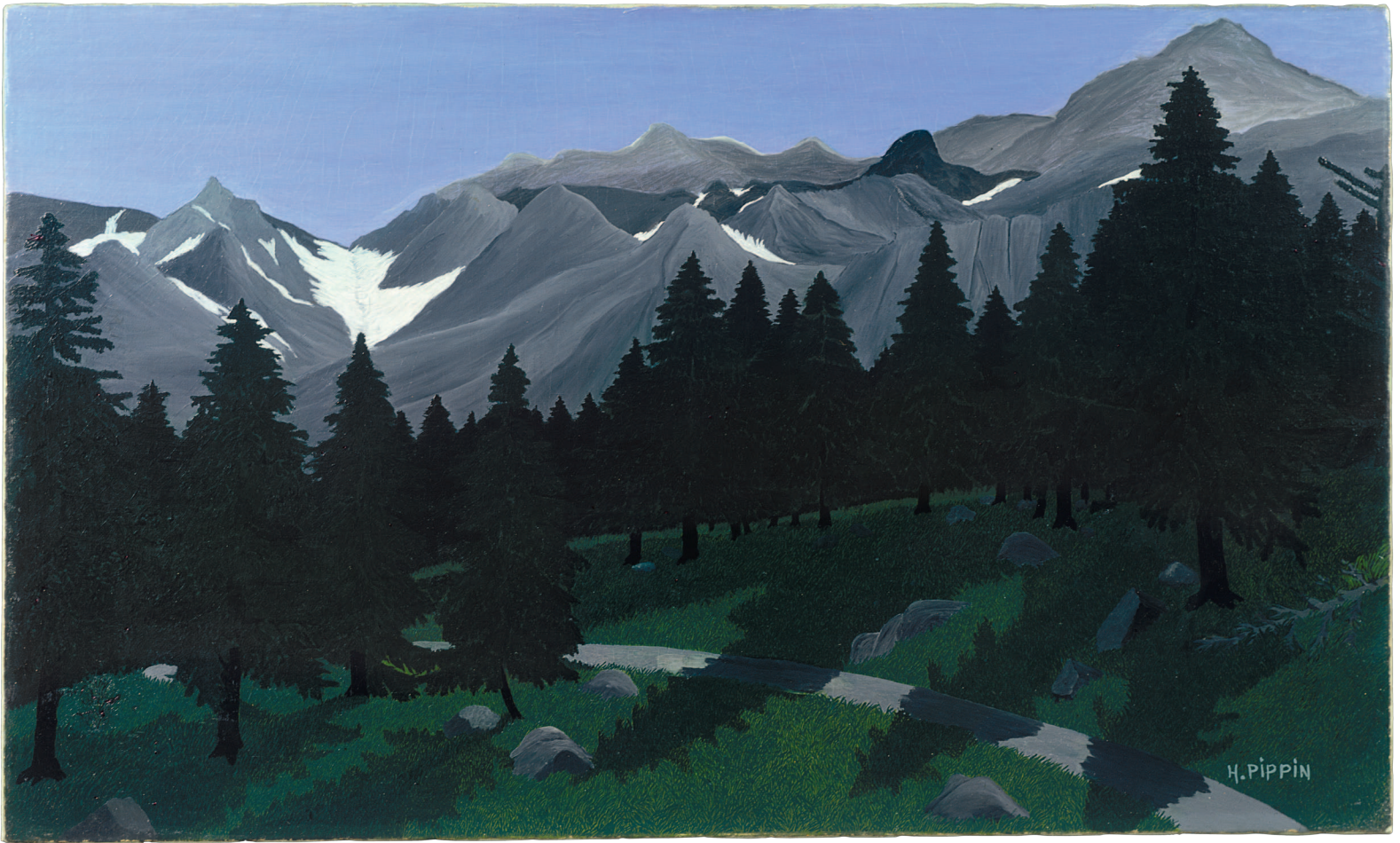
fig. 13 Horace Pippin. Mountain Landscape (Lush Valleys) , ca. 1936–39. Oil on fabric, 23 × 29½ in. (58.4 × 74.9 cm). Myron Kunin Collection of American Art, Minneapolis

rhythmic distribution of red, a color that Pippin rarely used with such enthusiasm in other works of the 1930s. 48