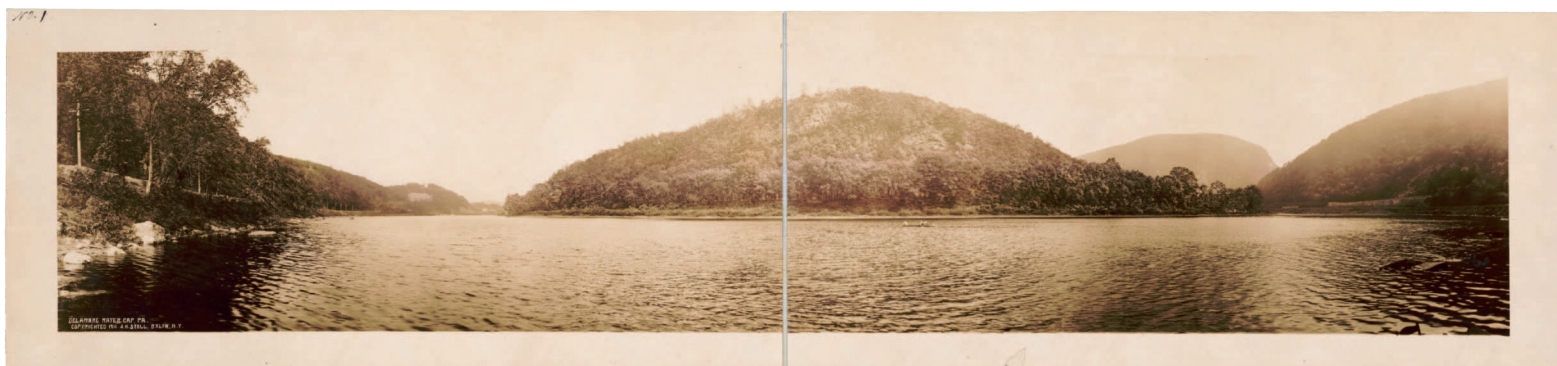
fig. 16 J. H. Stall (active early 1900s). Delaware Water Gap , ca. 1911. Gelatin silver print, 7 × 32½ in. (17.8 × 82.6 cm). Library of Congress, Prints and Photographs Division, Washington, D.C.

By Pippin's first solo show in New York that October, the anomalies of The Lady of the Lake were plain to critic Edwin Alden Jewell, whose nonetheless favorable reviews dismissed the "whimsical" canvas as "no more than quaint—quite sincere, no doubt, but obscurely fanciful rather than creatively imaginative." 74 Undeterred,