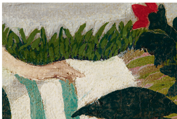
fig. 11 Detail of the blanket fringe of The Lady of the Lake (fig. 2)

Visual examination, X-radiography, and infrared photography of the reverse indicate that Pippin made repeated attempts to resolve the anatomy of the right shoulder before hiding the problem under the figure’s restyled hair, a change that contributed to the image’s iconographic reorientation from nature to culture (fig. 10). At first, the nude had long, black hair, maybe pulled into a braid or ponytail, which draped over her right shoulder, counter-gravitationally across her breast, and down along her side. To cover his painting difficulties, Pippin reworked the hair to fall partway down the figure’s back in gentle waves, lightened it to brown, and shortened it to preserve a view of the torso. The result