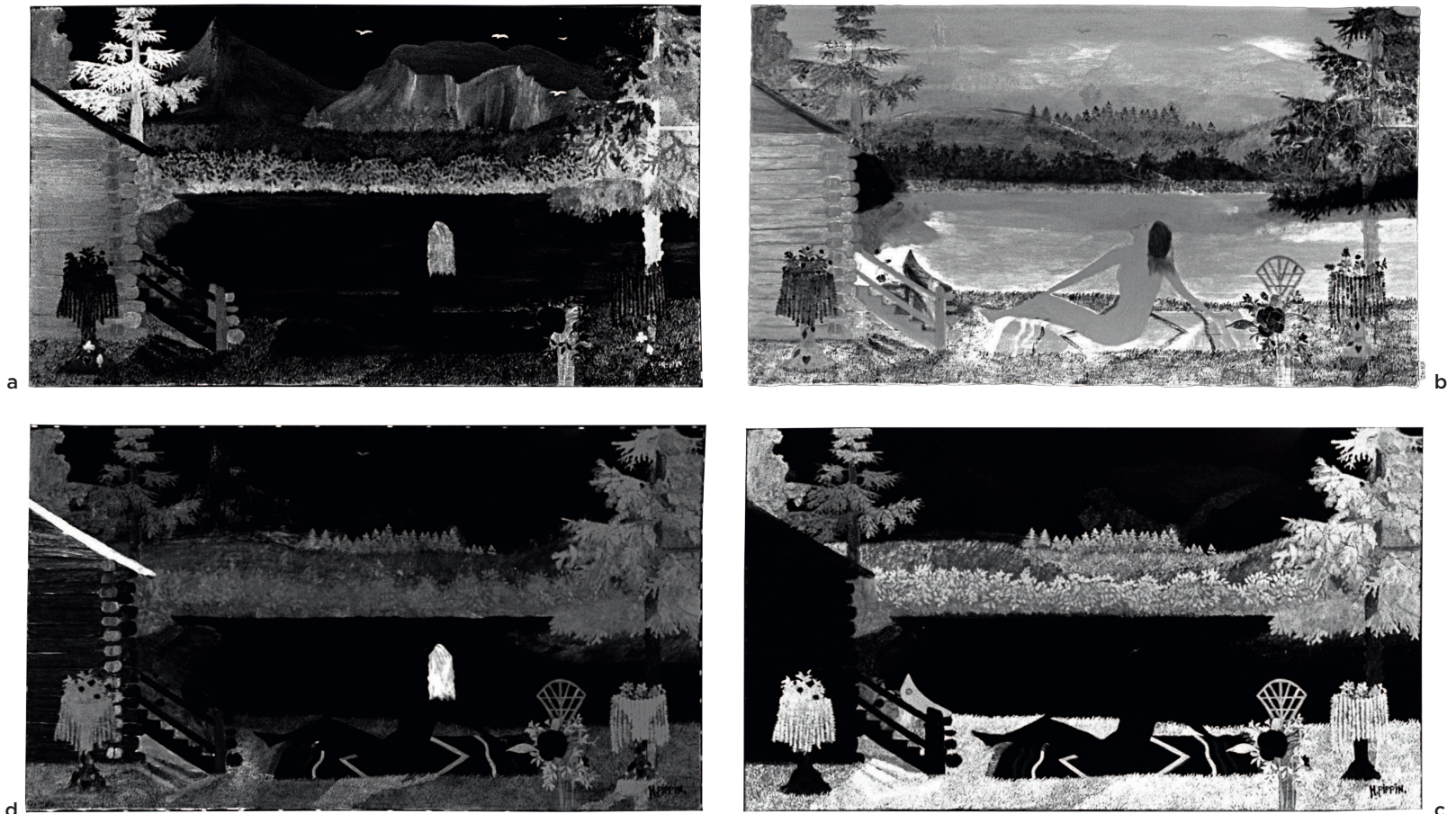
fig. 12 Elemental maps acquired by XRF imaging of the front of The Lady of the Lake . White indicates the distributions of (a) calcium, (b) zinc, (c) chrome, and (d) iron in the composition.

The odd planters, an obvious sign of domesticated nature, are among the last and most reworked additions to the composition. They began as flare-shaped, ocher stands, which Pippin repainted gray, partially obscured with red flowers and pendulous foliage, then decorated with suits from a deck of playing cards (fig. 12). 45 Presumably about the same time, he added plants elsewhere to resolve compositional difficulties. Flowering plants fill the gap behind the stairs, and a trellised rosebush hides what may have been a tree stump like those in Teacher's College Powerhouse (ca. 1925–30, Harmon and Harriet Kelley Foundation for the Arts, San Antonio), Abraham Lincoln and His Father Building Their Cabin at Pigeon Creek (ca. 1934–37, Barnes Foundation, Philadelphia), and The Getaway . 46 This promiscuous display of flowers marks an early engagement with the floral subjects that he would come to favor heavily in the 1940s, as in Victorian Interior I and Victorian Interior II . 47 It also animates the lower half of the image with a