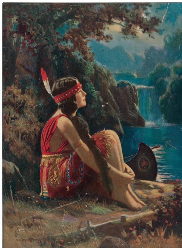
fig. 15 R. Atkinson Fox (Canadian American, 1860–1935). In Meditation, Fancy Free , ca. 1920s. Chromolithograph(?), 11 × 14¼ in. (27.9 × 36.2 cm)

Like the embedded blanket's reference to Goshen, The Lady of the Lake may also encode a personal connection in that Pippin grew up near the Pocono Mountains of eastern Pennsylvania, the site of an early iteration of the legend of Winona. 61 In that version, set as the Dutch were surrendering their colony to the English in the seventeenth century, the chief's daughter (an "Indian princess") leaped to her death from Winona Cliff, Pennsylvania, when her Dutch beloved announced his return to the Netherlands. 62 It is tempting to see parallels in that landscape (fig. 16) with the rolling hills and river of the initial design of The Lady of the Lake .