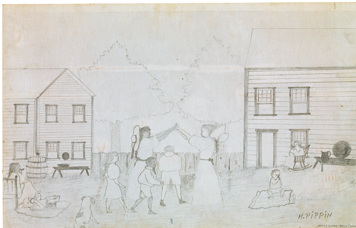
fig. 6 Horace Pippin. After Supper , ca. 1935. Oil on fabric, 19 × 23½ in. (48.3 × 59.7 cm). Collection of Leon Hecht and Robert Pincus-Witten, New York