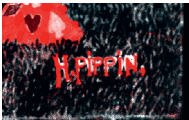
fig. 14 The Lady of the Lake , details of signature (top) and XRF maps (bottom) showing the distribution of calcium (white) and titanium (red) originating in the black and white paints respectively. The black pigment is a carbon-based black, such as bone black, and the white is titanium white.