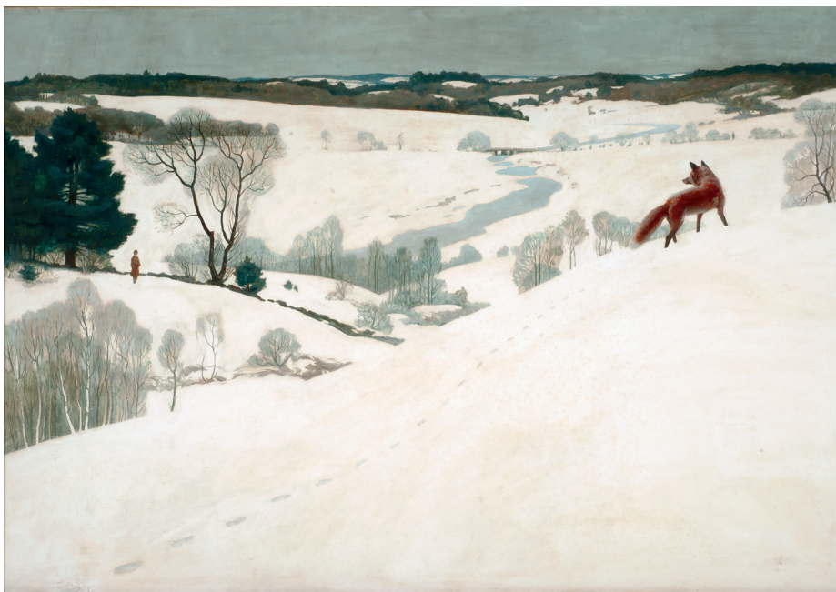
fig. 17 N. C. Wyeth (American, 1882–1945). Fox in the Snow ( The Fox ), ca. 1935. Oil on hardboard, 28½ × 41 in. (72.4 × 104.1 cm). Arkell Museum at Canajoharie, New York, Gift of Bartlett Arkell, 1940

Almost certainly informed by Pippin's statement in the MoMA catalogue, Upton made his enthusiastic case for Pippin by using his modernist style as a screen on which to project racist assumptions about his heritage, motivations, and meanings. While the text may palliate the artist's formal innovation for viewers weary of "sophistication" and qualify him for a market that valorizes autodidacts on the basis of a marginalized social or cultural position, it also institutionalizes racial meanings, identities, and stereotypes in and beyond the visual arts, a field where quality is supposedly indifferent to extra-aesthetic considerations like race. 79 As is clear from Upton's omission of The Lady of the Lake , which was included in that show, the painting has no place in such a calculus. Not only does its dialogue with academic tradition undo the critic's characterization of Pippin as willfully immune to outside influence, but also its instantiation of African American agency in an interracial context (namely, a black man asserting his right to paint a nude, white woman) also counters the racial stereotypes on which such compromised analyses rest. Moreover, it does so at a time when black men were being lynched in the United States on the pretext that they posed a threat to the purity of white women. 80