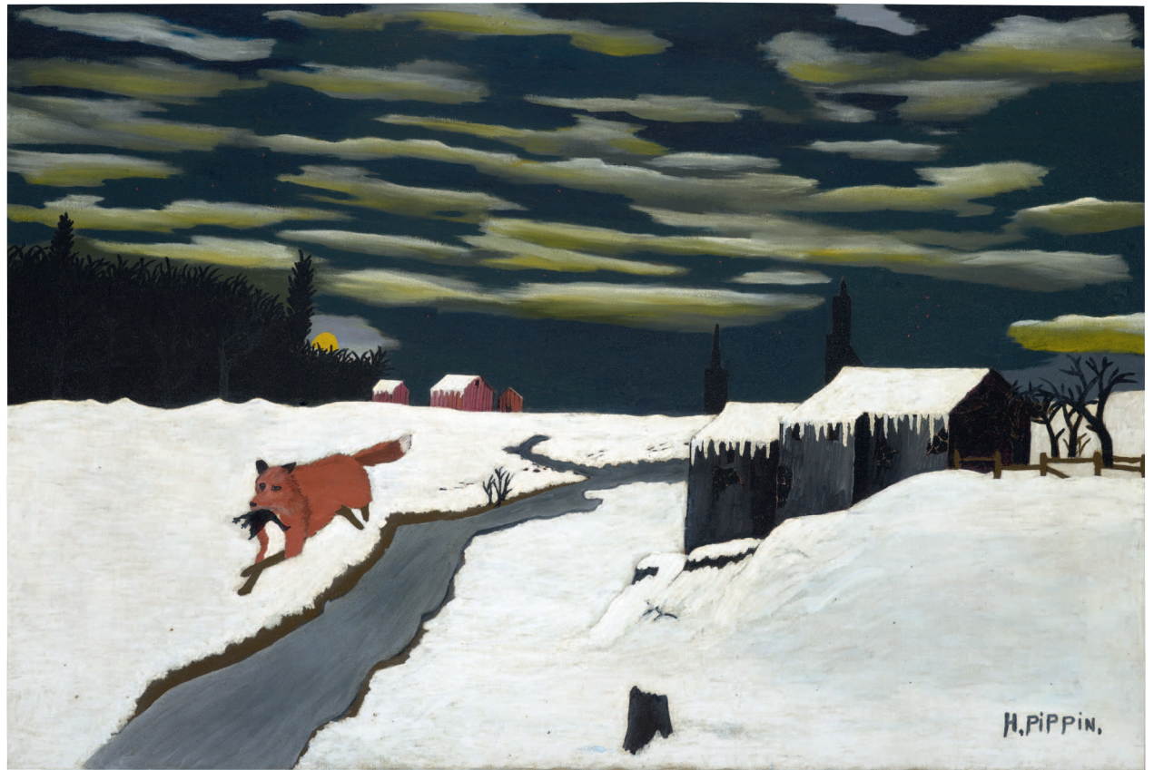
fig. 4 Reverse of The Getaway (fig. 3)